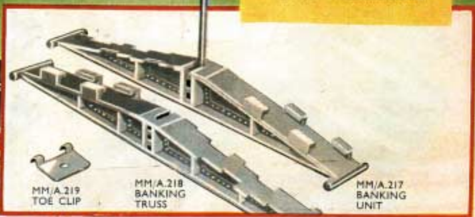
MM/A.219 TOE CLIP

DESCRIBED IN DETAIL IN THE NEW 1960 MANUAL.