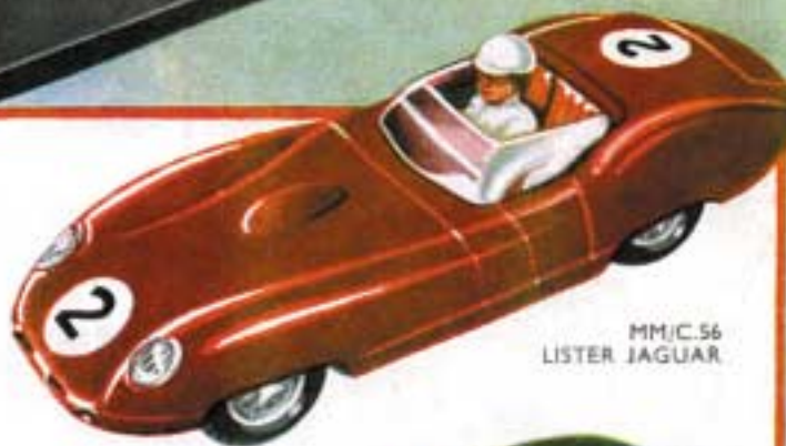
MM/C.56 LISTER JAGUAR

2 GRAND PRIX and 2 COMPETITION MODELS with PLASTIC BODIES, fully detailed and POWERED WITH A MODIFIED ROVEX MOTOR. T.V. SUPPRESSED.