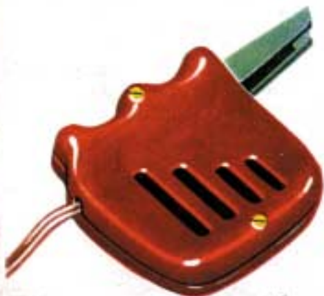
MM/A.215 HAND CONTROLLER FOR VARIABLE SPEEDS