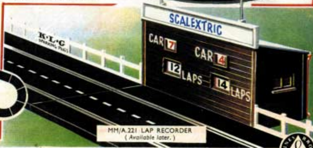
MM/A.221 LAP RECORDER (Available later.)